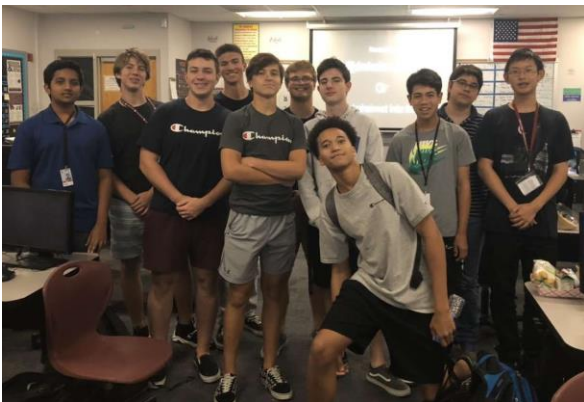
YIS Club at Desert Mountain HS, Arizona

The Global Stock Pitch Competition will take place in Salt Lake City this year at the University of Utah campus, which should be a fantastic facility for the kids to gather, learn and compete. The event will take place on Friday May 20 th , so be sure to mark your calendars and book your flight if you would like to join!